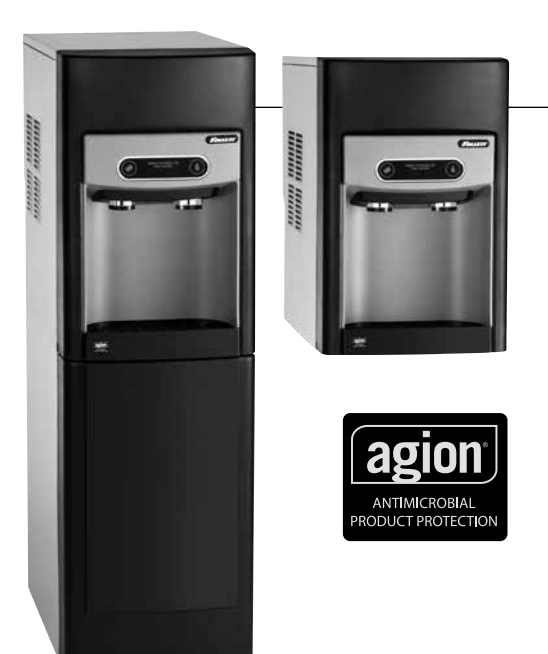
Shown with optional base stand

NOTE: For use in applications with greater than 5 mg/l but less than 400 mg/l total dissolved solids in water and less than 200 mg/l hardness (either naturally occurring or treated with reverse osmosis or other TDS reducing technology).